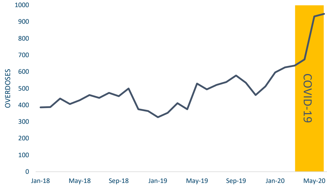
MONTHLY ED REPORTED OVERDOSES INDIANA