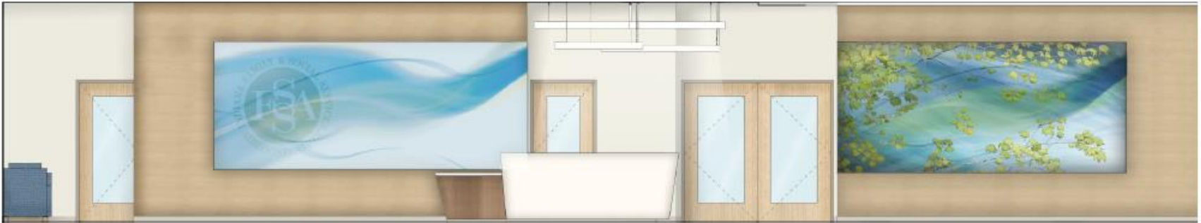
Option 1 – Water Imagery