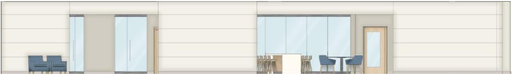
Option 1 – Curved Wall – Painted