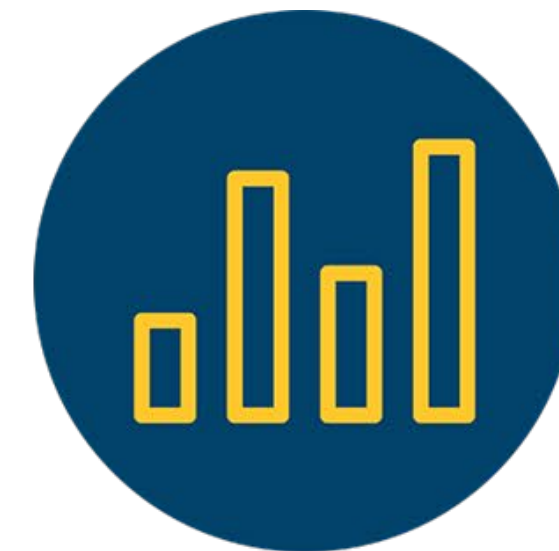
IT & BUSINESS SERVICES